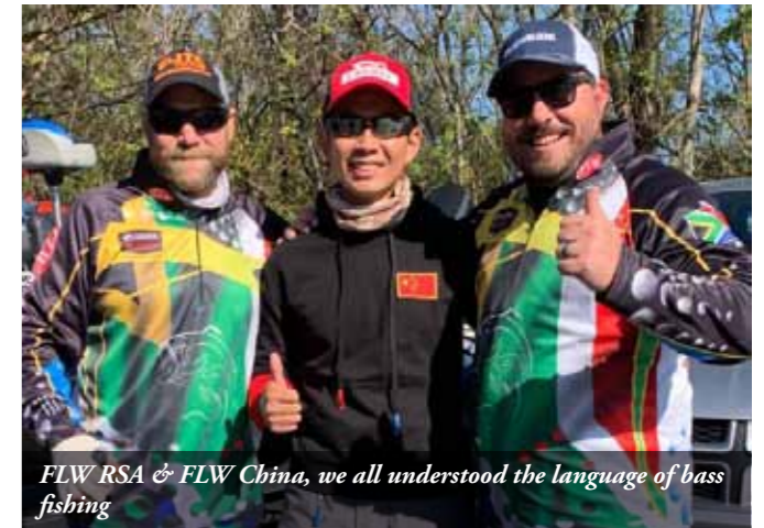
FLW RSA & FLW China, we all understood the language of bass fishing

and just do my own thing. My practice was tough, but I caught a couple of nice fish and left the areas immediately. As soon as I'd catch a fish I'd leave. I went back to those areas today, and they panned out."